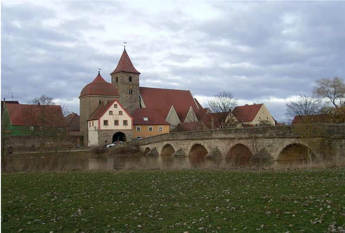
Ornbau, Bavaria and Herzog, Kansas